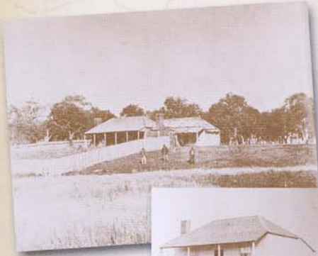
Rear Hut 1836 Front Hut 1853